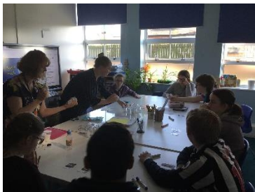
Post 16 students in a healthy eating session with the nursing team, comparing sugars in a range of food and drink.

As we are all increasingly aware, diet and nutrition play an important role in the mental, physical and social development of a child. The establishment of healthy eating in childhood can reduce the risk of health issues in later life. With this in mind, we aim to establish good eating habits that support growth and promote healthy lifestyles into adulthood. However, we also realise there will be times when treats are acceptable for special occasions or at special events, for example at a charity bake sale. Recently we have noticed in school that some children are regularly bringing in snacks with a high fat and sugar content and would like to take the opportunity to work with children to enable them to make healthier choices. At Woodlawn, we feel that it is beneficial for all children to have a healthy snack at break time. This is an important part of the diet for young people who may not get enough energy for growth and development from their three main meals and because snacks can positively contribute towards a balanced diet (providing foods, which are high in sugar, fat or salt, are avoided). We want to encourage healthy snacks at break time, particularly fruit and vegetables